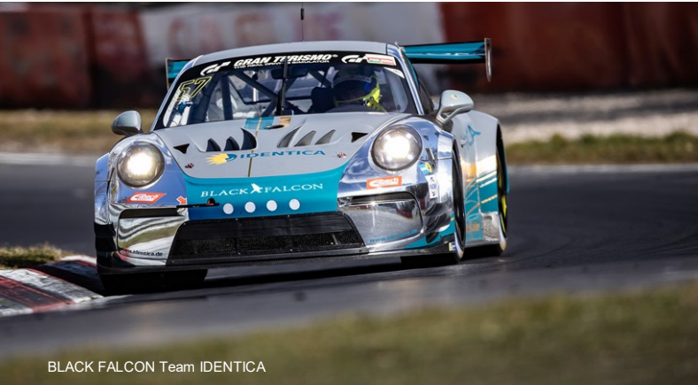
BLACK FALCON Team IDENTICA