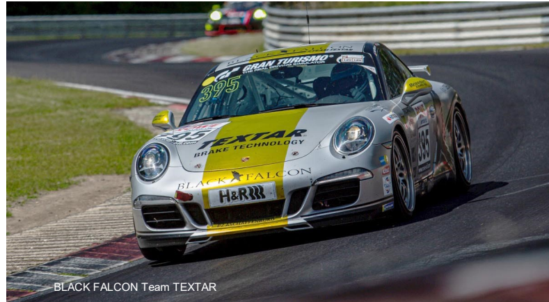
BLACK FALCON Team TEXTAR