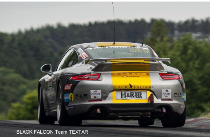
BLACK FALCON Team TEXTAR