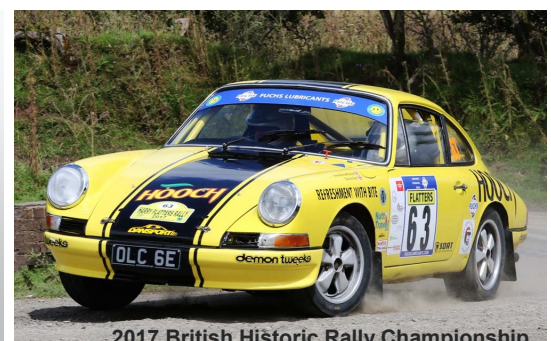
2017 British Historic Rally Championship