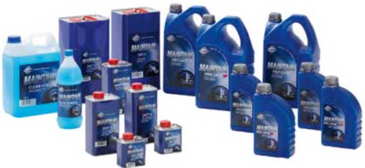
MAINTAIN Product Range

Antifreeze must meet many requirements, as an average of around 150 liters of coolant are pumped through the cooling circuit of a typical passenger vehicle every minute. One third of the heat generated during combustion is dissipated into the atmosphere via the coolant. The coolant itself passes over more than 100 different materials and must be compatible with all of these.