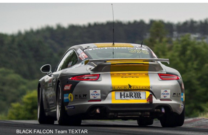
BLACK FALCON Team TEXTAR