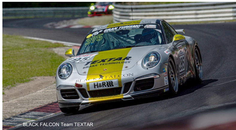
BLACK FALCON Team TEXTAR