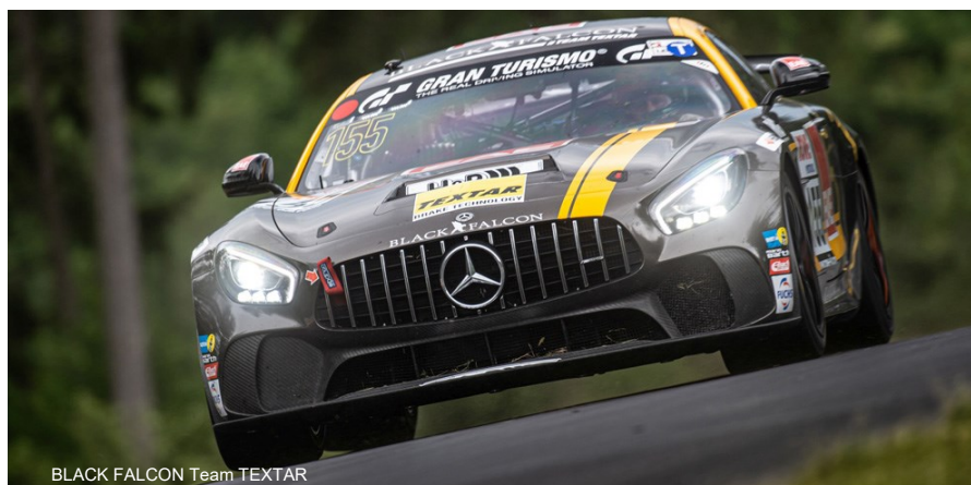
BLACK FALCON Team TEXTAR