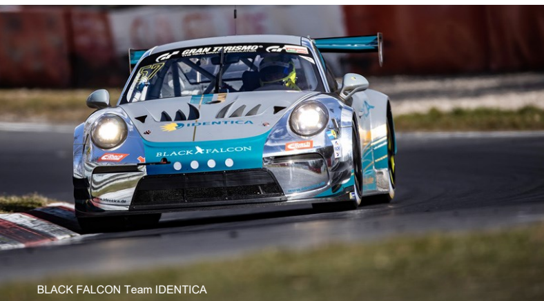
BLACK FALCON Team IDENTICA